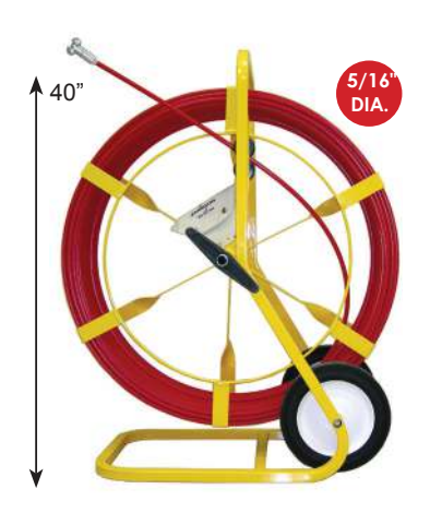
DUCT HUNTER™ 5/16"