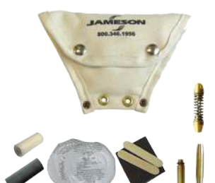
1/4" Duct Hunter Accessory Kit