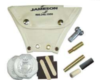
5/16 & 7/16" Duct Hunter Accessory Kit