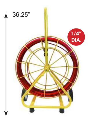
DUCT HUNTER™ 1/4"

New Jameson pre-loaded replacement reel improves the speed and safety of swapping out damaged conduit rod.