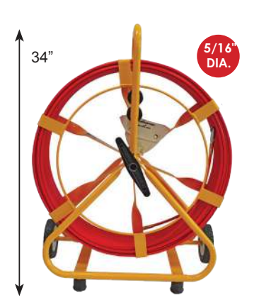
DUCT HUNTER™ 5/16"