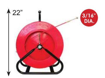
MINI DUCT HUNTER™ 3/16"