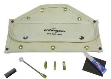
1/8" & 3/16" Mini Duct Hunter Accessory Kit