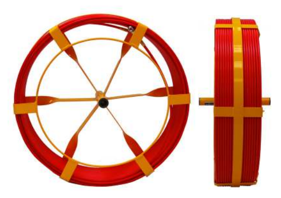
Duct Hunter Reel Replacement

However, on occasion it may be necessary to replace the entire spool of rod due to more severe damage. Removal, disposal and rod replacement can be a difficult and time-consuming task. Responding to customer feedback, Jameson introduced EZ-REEL pre-loaded replacement reels which help improve speed and safety of replacing damaged rod material.