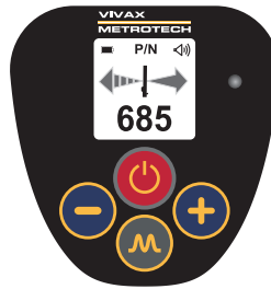
Left/Right cable location