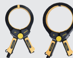
4" and 5" Signal Clamp