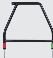
vLoc3 Accessory A-Frame