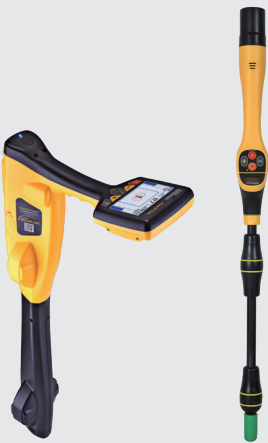
vLoc3-Cam and VM-540 Sonde Locators