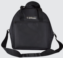
Reel Carry Bag