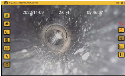
The VMC app controls all the reel functions

The reel is powered by internal Li-ion batteries, which provide consistent, clean, long-life power. A six-hour charge will provide 12 hours of power with intermittent sonde use.