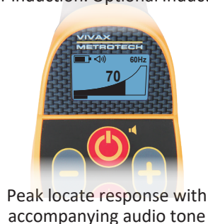
Peak locate response with accompanying audio tone