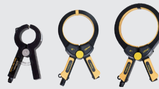
2", 4", and 5" Induction Clamps