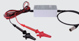
Live Cable Connector