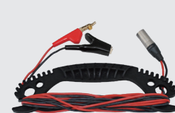
Telco Clip Direct Connection Lead