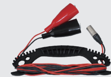
Heavy Duty Clip Direct Connection Lead