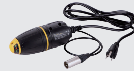
Live Plug Connector