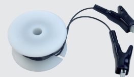
Ground Extension Spool