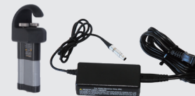
VM series Li-ion Rechargeable Transmitter Battery Kit